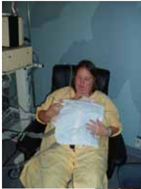
Parent- the primary caretaker