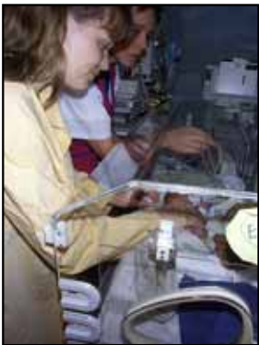
Infant: 29 w, 2 days